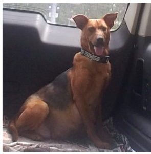
Happy freedom ride!