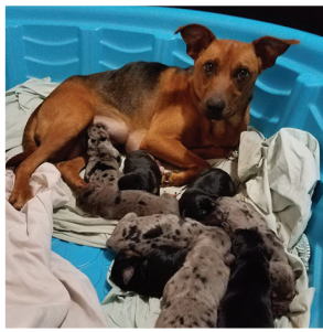
Awesome mama to 9 puppies!