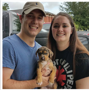
The first of Kyleigh's puppies is adopted!